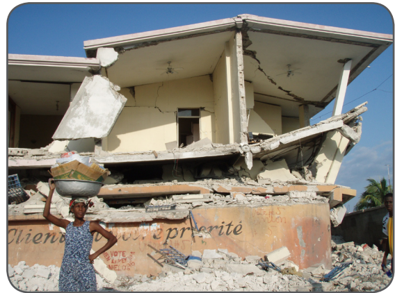
An earthquake in 2010 devastated homes in the nation of Haiti.

During an earthquake, seismic waves carry energy along Earth's surface and through the planet's interior. Breaks and slips between rocks in Earth's crust cause the energy to radiate outward in all directions. A geologist studies these movements to determine how, when, and where earthquakes form. This specialized area of geology is called seismology .